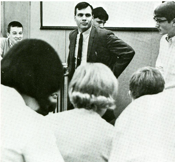
And ruled with some semblance of law ...