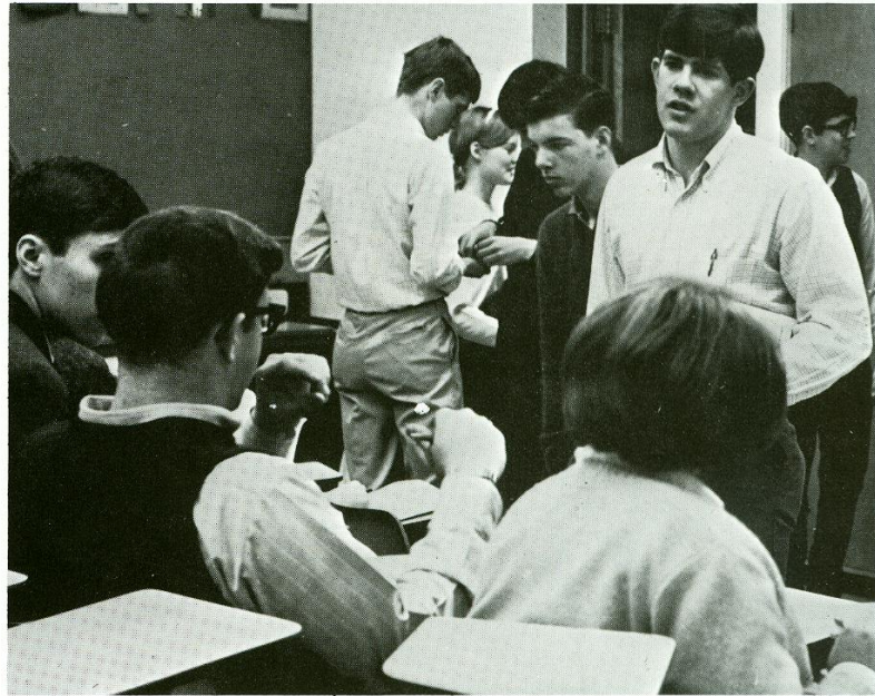
They met second hour every day ...