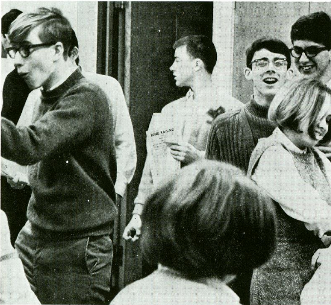
That taught a class of Juniors in team teaching ...?